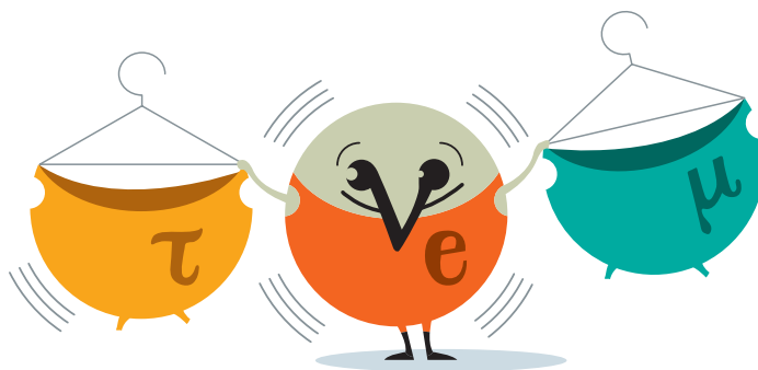
Torn between identities – tau-, electron- or myon-neutrino?

The hunt was on – deep inside the Earth in gigantic facilities where thousands of artificial eyes waited for the right moment to uncover the secrets of neutrinos. In 1998, Takaaki Kajita presented the discovery that neutrinos seem to undergo metamorphosis; they switch identities on their way to the Super-Kamiokande detector in Japan. The neutrinos captured there are created in reactions between cosmic rays and the Earth's atmosphere.